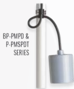
BP-PMPD & P-PMSPDT SERIES