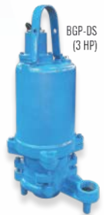
BGPH-DS (3 HP)