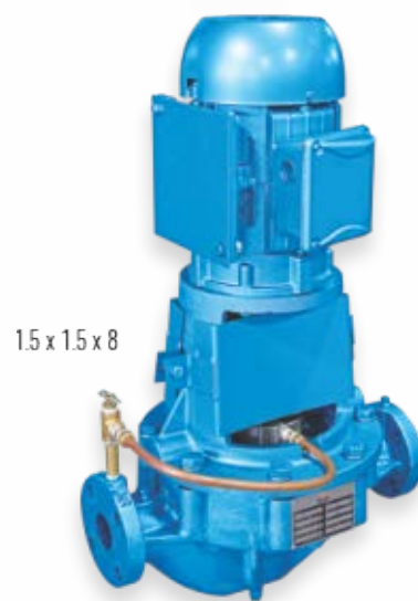
1.5 x 1.5 x 8