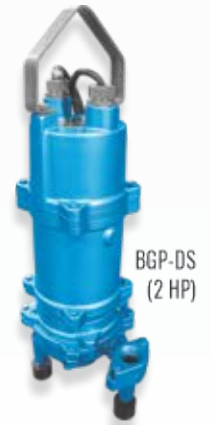
BGP-DS (2 HP)