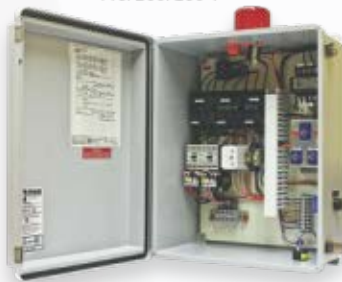
DUPLEX 3 PH 115/200/230 V