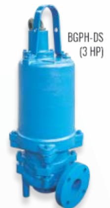
BGPH-DS (3 HP)