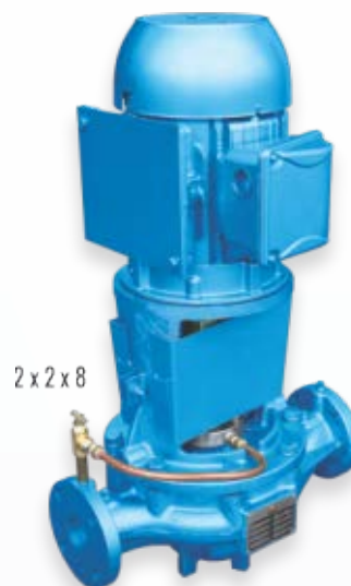
2 x 2 x 8