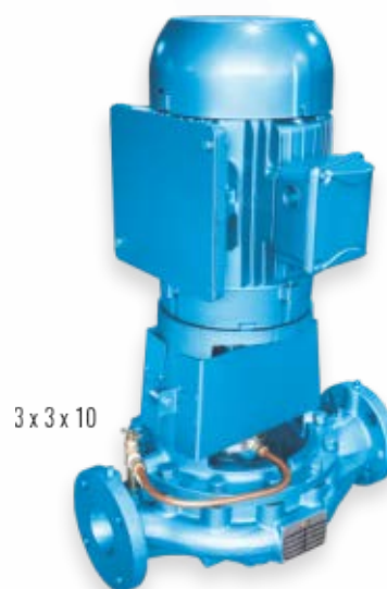
3 x 3 x 10