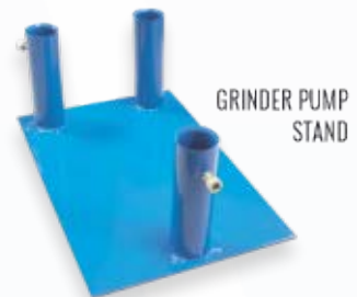
GRINDER PUMP STAND