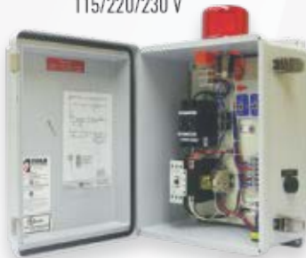
SIMPLEX 1 PH 115/220/230 V